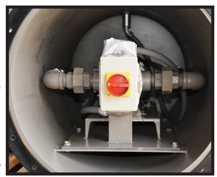
Submersible Light Oil Pump & Motor Assemblies

Oil pump and motor assembly shall be factory assembled in an epoxy-enamel coated carbon steel waterproof enclosure with external threaded connections for pump suction and discharge. The base-mounted motor shall be directly connected by a flexible coupling to a bi-rotational, internal gear pump, having self-adjusting mechanical seals and cast iron housing. The pump and motor assembly shall be mounted on a sliding steel base for easy access. Stainless steel flex hoses shall connect pump suction and discharge to couplings welded to the pump enclosure. A Preferred HD-A2C discriminating leak detector shall be installed at the low point of the pump enclosure to detect and annunciate the presence of oil or water. Electrical connections shall include sealed conduit and wire pigtails for termination above expected high water levels. Pump and motor assemblies shall be Preferred Utilities Manufacturing Corp., Danbury, CT.